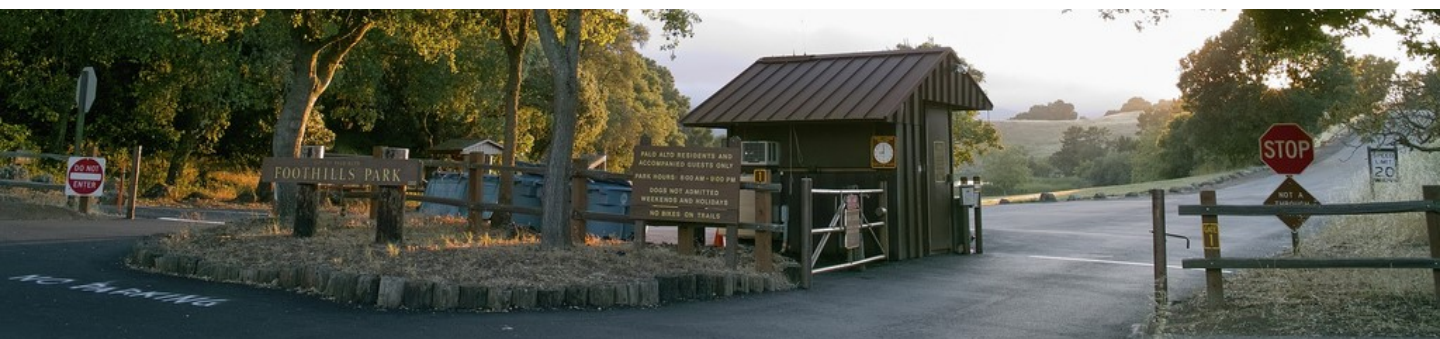
Foothills Park, near Palo Alto, CA