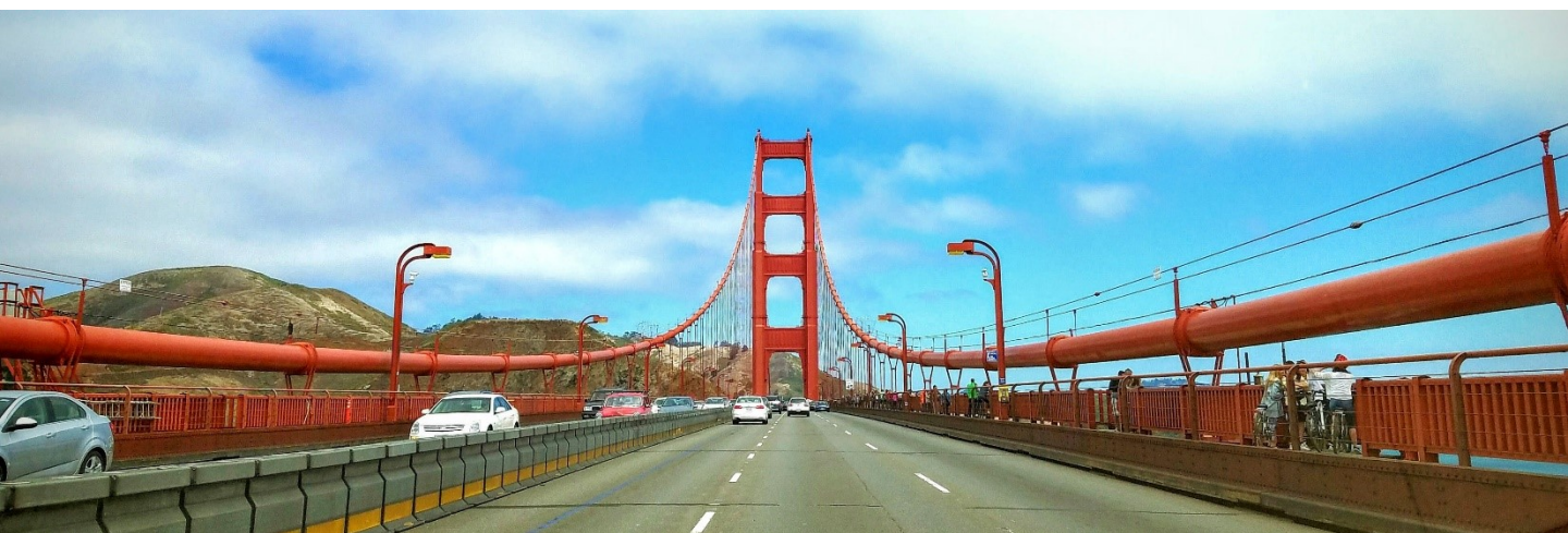
Golden Gate Bridge, San Francisco, CA